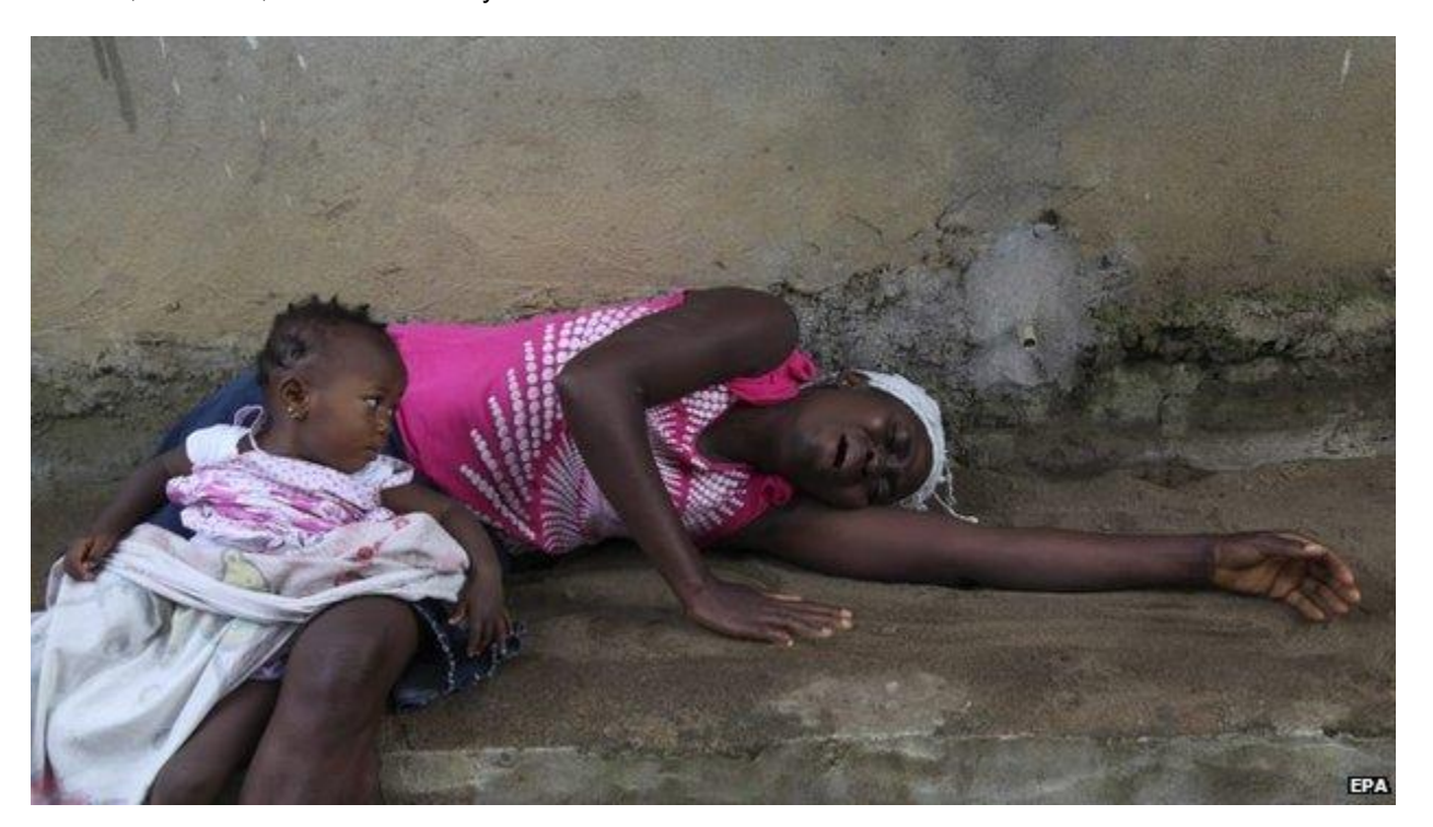
A Liberian woman weeps over the death of a relative from Ebola on the outskirts of Monrovia

Ebola spreads through contact with an infected person's bodily fluids and kills up to 90% of those infected. The health ministers of West African states met in Accra last week promising to work more closely together to combat the outbreak. So far, over 2500 people have been infected with the virus in Guinea, Liberia and Sierra Leone. Most of the 1500 deaths have been centred in the southern Guekedou region of Guinea, where the outbreak was first reported, and Liberia. PROFOH has designed and printed leaflets and posters and commenced Ebola Education program in Abuja, Nigeria and Accra, Ghana .The Board sincerely thanks the Abuja team for the wonderful work on Ebola Education. Currently, discussion is on-going with Akwa Ibom State Ministry of Health for possible collaboration with PROFOH team to fight the disease. PROFOH Germany has also shown some interest in helping out. Our organization agrees with Keiji Fukuda of WHO, who said, .'This is not a mysterious disease. This is an infectious disease that can be contained'.