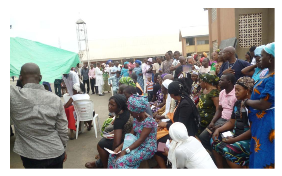
Thousands of Patients waiting for PROFOH at Medical Mission, Abuja Nigeria

July : Nigeria accounts for about 13 percent of the global maternal death rates with an estimated 36,000 women dying in pregnancy or at child birth each year. At least 5500 of these deaths are among teenage mothers. This is as Jigawa State in the North topped the list of teenage mothers with 78 percent of its girls between ages 15-19 in early marriage. Jigawa is closely followed by Katsina, Zamfara, Bauchi and Sokoto states.