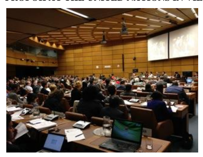
PROFOH at the United Nations