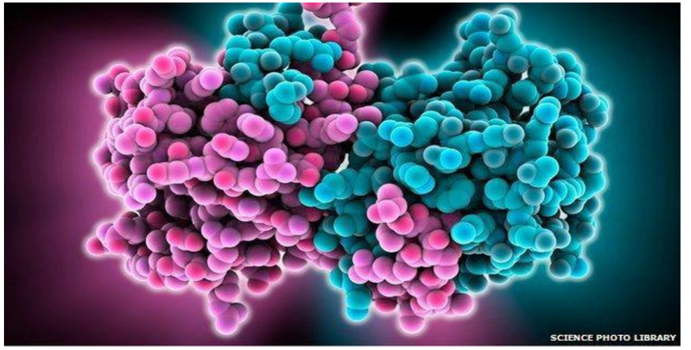
Ebola Virus Diseases (EVD)