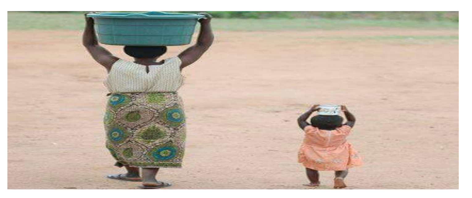
Photo; 1.6 billion people do not have access to clean water at home