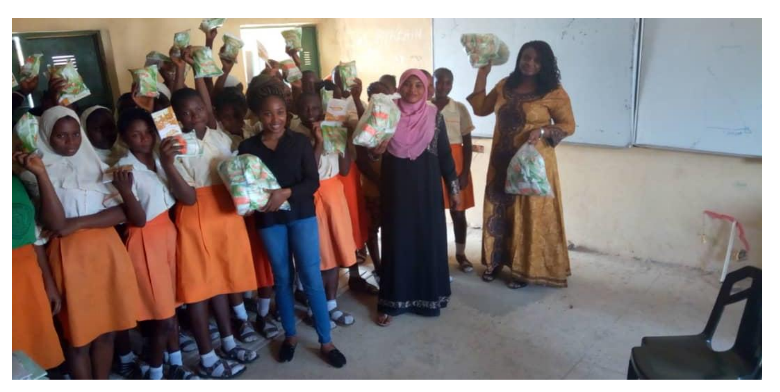
Photo; Distribution of reusable sanitary towels to female high school students in Abuja Ogun State Nigeria

It is a simple project but very impactful, girls in rural community across Africa are very disadvantaged due to their monthly menstrual period —they skip classes for a week some do during their examination period, some have suffered high level infection as a result of using piece of rags, lots of these young women we have treated during PROFOH medical missions. Our organization is pleased to note that some female political leaders are now showing interest, Example is the First Lady of Sierra Leone, distribution of washable sanitary pads in Freetown is her flagship project. PROFOH has conducted this mission in the past, the outcome was amazing, Girls Academic performances increase by almost 52%, as soon as the security situation in Katsina State normalizes we shall resume of distribution. The unique aspect of our towels —they are clinically tested and washable and could be reusable for three years.