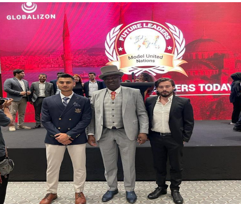
Photo: Diner party in honor of PROFOH Germany Board members at the Hilton Hotel Abuja Nigeria Photo: PROFOH Country Director Turkey at United Nations Globalization summit, Istanbul Turkey