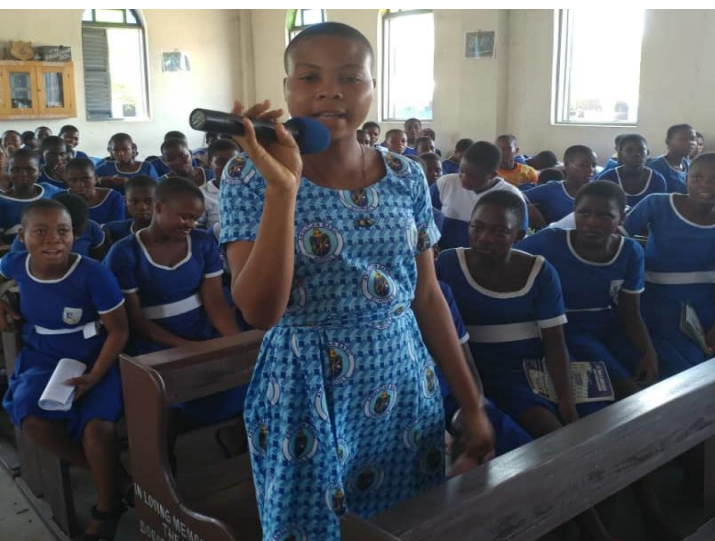
Photo; PROFOH Education mission in Ogun State Nigeria and Volta region Ghana