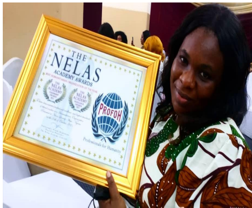
Photo: Best Humanitarian organization of the Year by NELAS Academy &Leadership Awards Nigeria.