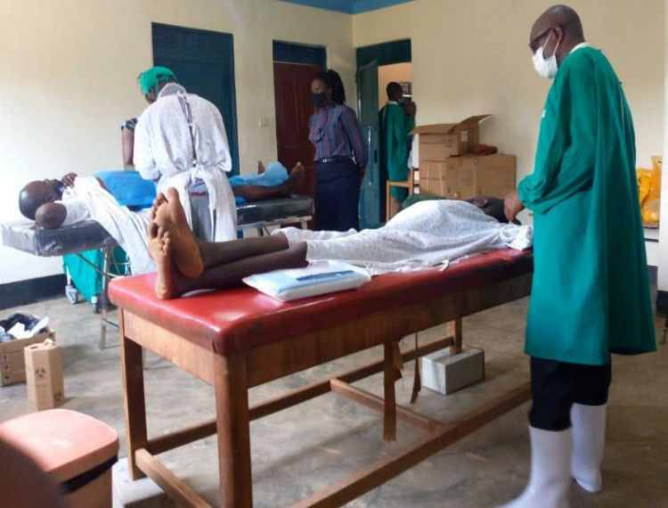
Photo; Alemere, Uganda mission- Clinical examination and getting ready for surgery.