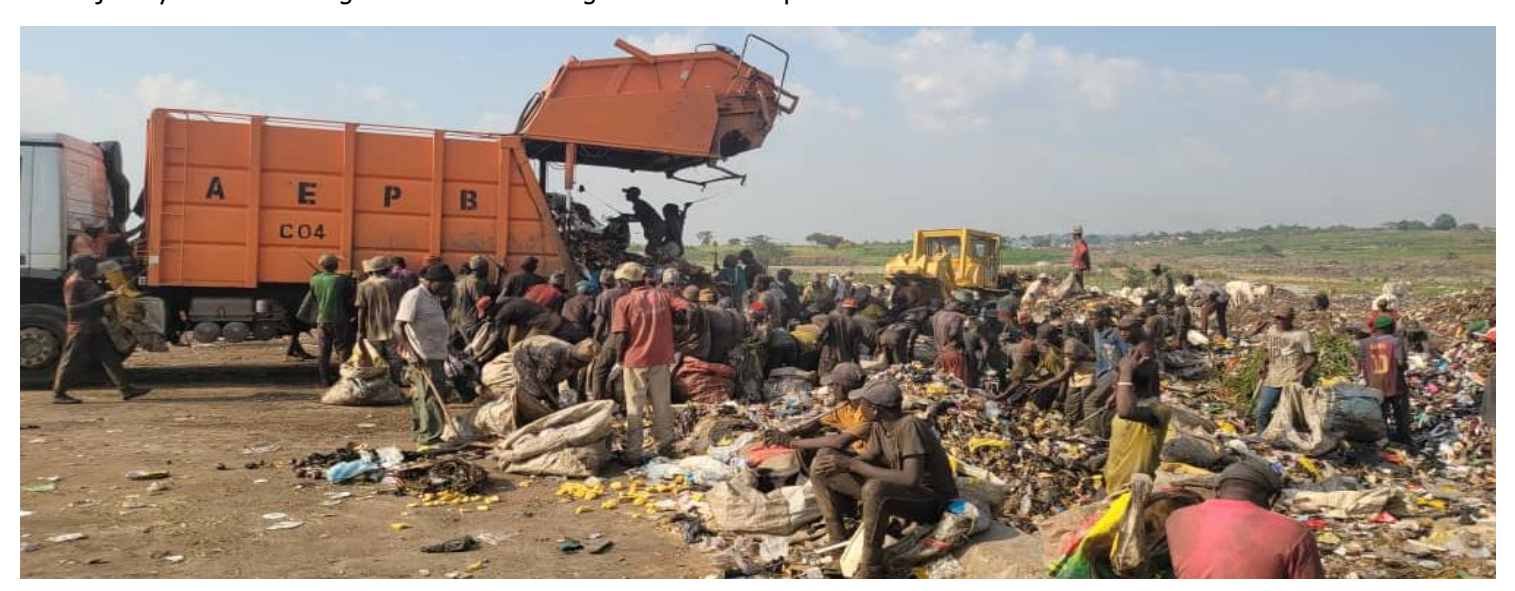
Photo: Some of the pickers and underserved at the Idu Station dumb site, Abuja Nigeria.

WHO and UN studies testify a direct correlation in between hygienic and efficient Circular Economy combating disease incidences as Cholera, Malaria, Dengue, Typhus, etc. Circular Economy has a direct link to hygiene, water and sanitation, underwater pollution – The team met with top government officials' policy makers three states government, Borno, Gombe and Kaduna including the Minister of Abuja City. There was high interest from the government and private sector.