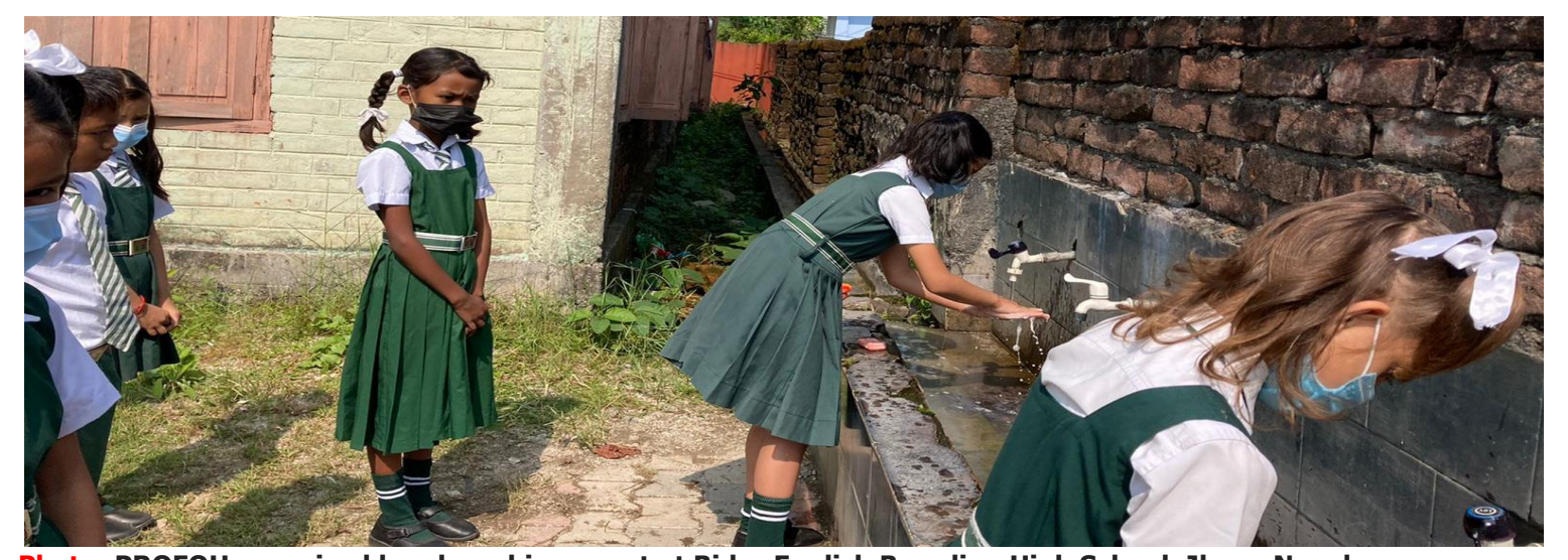
Photo; PROFOH organized hand washing event at Bidur English Boarding High School, Jhapa Nepal