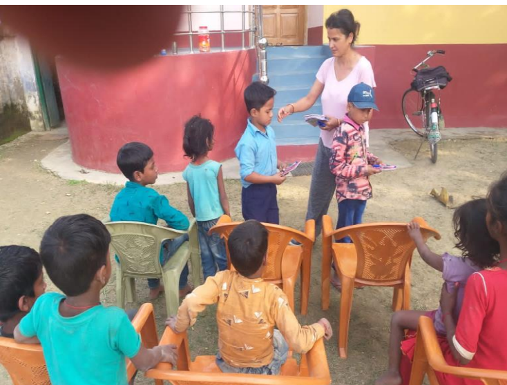
Photo; PROFOH Emergency Education in intervention in Kathmandu in the past and Sarlahi district Nepal- 2021