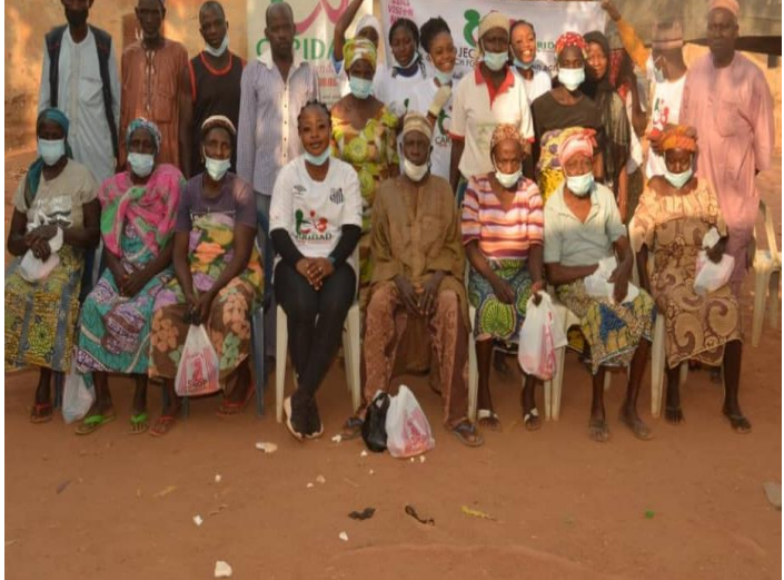
Photo; Abuja mission- A nurse taking vital signs and photo session with some of the beneficiaries of the mission