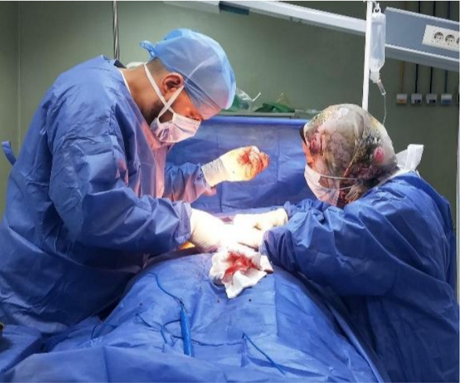
Photo: Some of the surgeries performed in Aswan-Egypt in December 2021