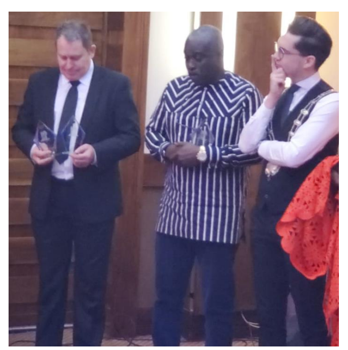
Photo: Humanitarian organization of the Year Award by The Essence Group Republic of Ireland.