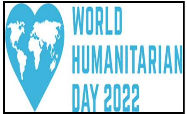
Photo: World Humanitarian Day flyer

As a leading organization in humanitarian interventions PROFOH join others and the United Nations family to celebrate this year World Humanitarian Day. our members work with passion and compassion in high risks communities, striving to bring the best in humanity. The Day falls on 19 August, the day in 2003 when 22 aid workers were killed in a bombing at the UN Headquarters in Baghdad. It's a day to honor both those who have lost their lives in humanitarian service and those who continue to bring relief and assistance to populations affected by disaster, every hour of every day, humanitarian work continues around the world, and saves lives.