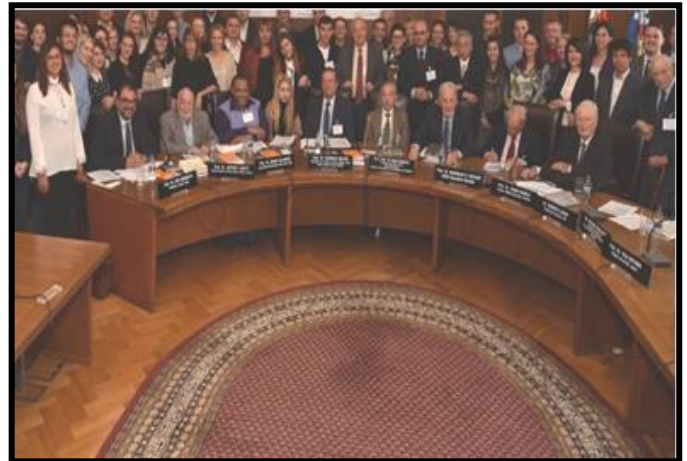
Photo: A similar summit attended by PROFOH

After two years of the pandemic, and in the midst of multiple international crises, progress on the Sustainable Development Goals (SDGs) is at risk globally. Achieving the SDGs requires significant investments on human capital, physical infrastructure, and environmental protection. Nevertheless, many countries in the world still struggle to mobilize the financing needed to achieve the SDGs. The event brought together government and United Nations (UN) officials, as well as representatives of International Financial Institutions (IFIs), civil society and academia, to discuss the issue of financing to take concrete actions for the SDGs. The UN Resident Coordinator of Samoa debated on the role of public expenditure for achieving the SDGs and on the relevance of measuring the scale of financing that countries need to achieve the goals set out in the 2030 Agenda. Representatives of Multilateral Development Banks (MDBs) and other international organizations engagement in on how they can help expand financing for the SDGs, while government officials shared their experience on the use of innovative financing mechanisms such as SDG bonds and blue bonds. The role of private finance in promoting sustainable development was also be discussed.