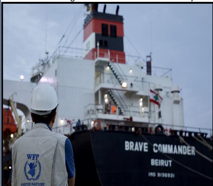
Photo: WFP First Shipment to the Horn of Africa

This is the first shipment of humanitarian food assistance under the Black Sea Grain Initiative signed by Ukraine, Russia, Turkey and the UN in July. The first WFP ship with wheat grain left Ukraine an important step to reduce food prices and provide a lifeline to humanitarian operations. The shipment was made possible with emergency funding from USAID Saves Lives donors like the Howard G Buffett Foundation.It marks another important milestone in efforts to get much-needed Ukrainian grain out of the war-torn country and back into global markets, to reach people worst affected by the global food crisis.