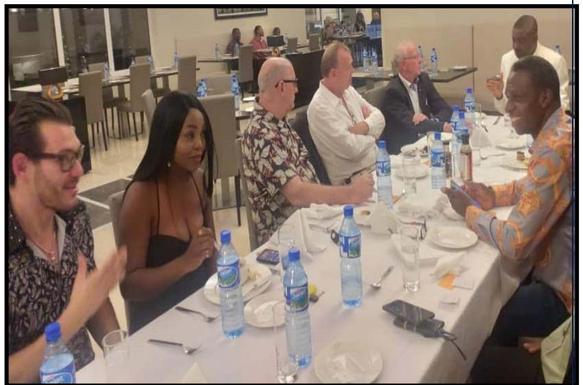
Photo: Dinner in honor of PROFOH Germany Board members