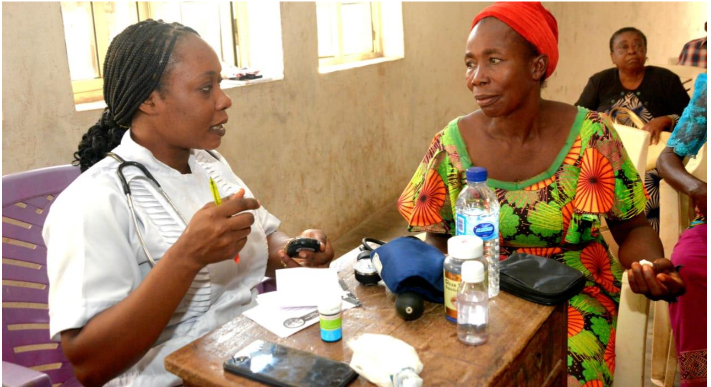
Photo: PROFOH Nigeria team during patient consultation at the Epe Lagos mission.

PROFOH provided technical support for the Epe medical mission in collaboration with WCEO, BFGO, and churches across the Local Government Area in Lagos, Nigeria. The theme of the mission was "Reaching the Unreached with Gospel and Health Care." The mission was driven by the need to provide quality care to some of the most neglected communities in Lagos, the commercial capital of Nigeria and the second-largest city economy on the African continent after Cairo. Since our inception as an organization, Lagos State has benefited from our interventions more than any other state, with missions conducted in Surulere, Ikorodu, Ijodu, Okota, Lekki, Onikan, Shomolu, and many other locations.