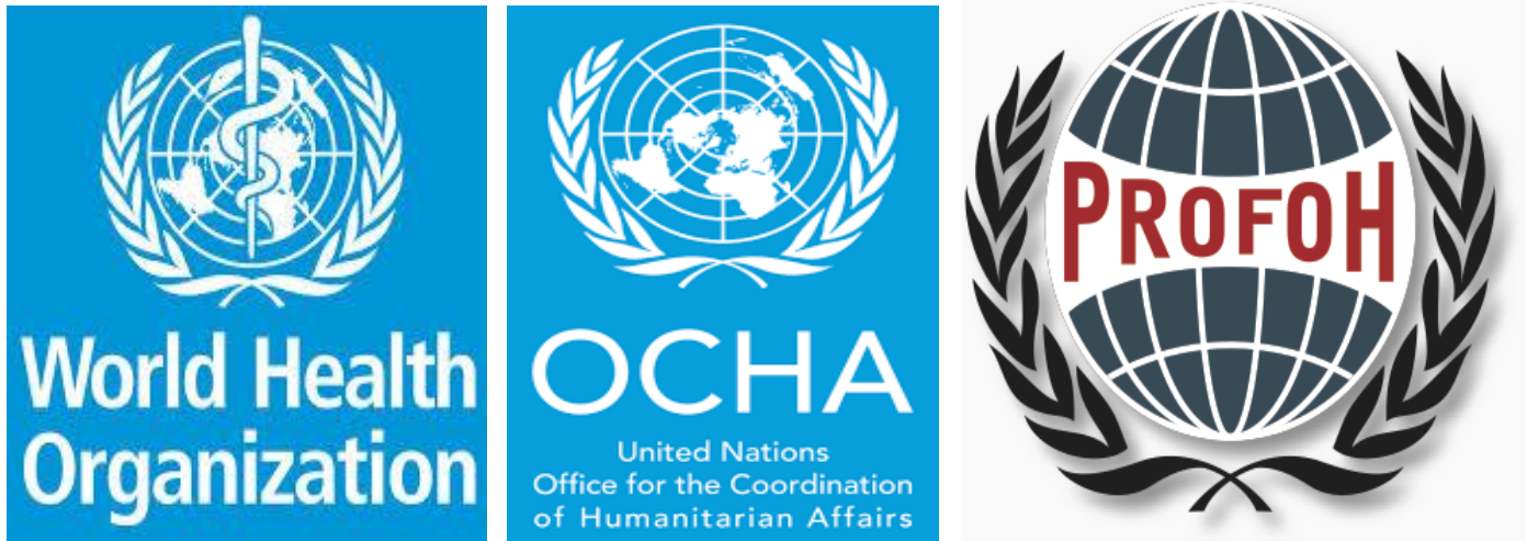
Photo: Official Logos of both United Nations Agencies supported by PROFOH Financially