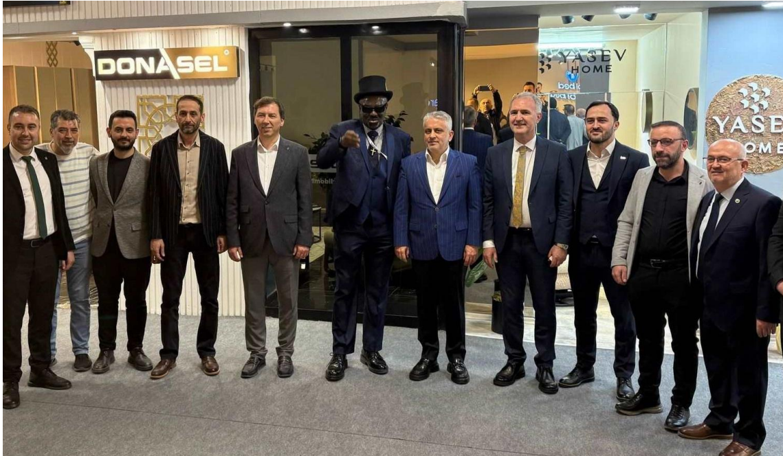
Photo: PPROFOH Representative in Turkey official meeting with the Mayor of Inegol on the possibility of a mental health mission in Turkey.