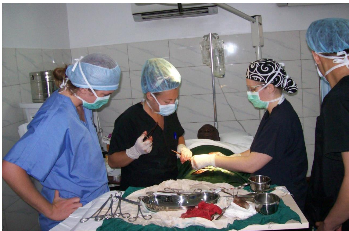
Photo: Surgeons from Texas, United States performing Surgery in Lagos, Nigeria.