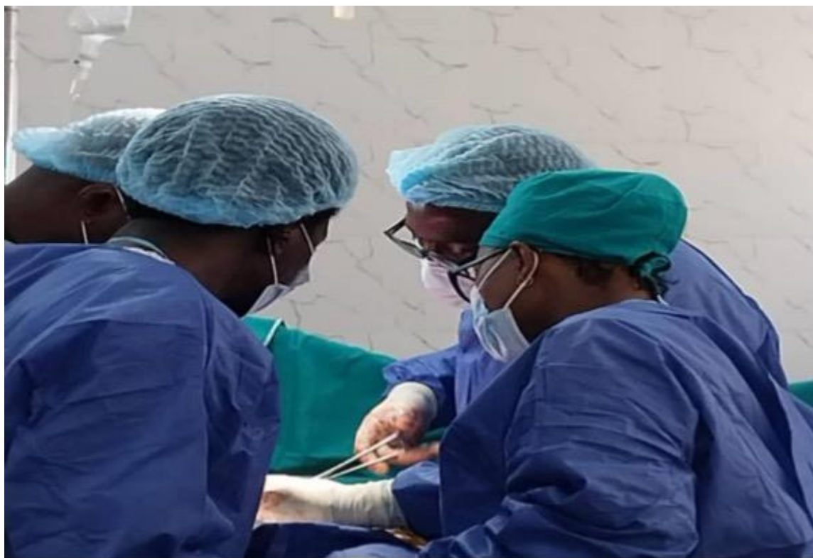
Photo: Surgeons from Sierra Leone and Zambia perform cervical cancer surgery in Freetown through a South–South training exchange supported by WHO .