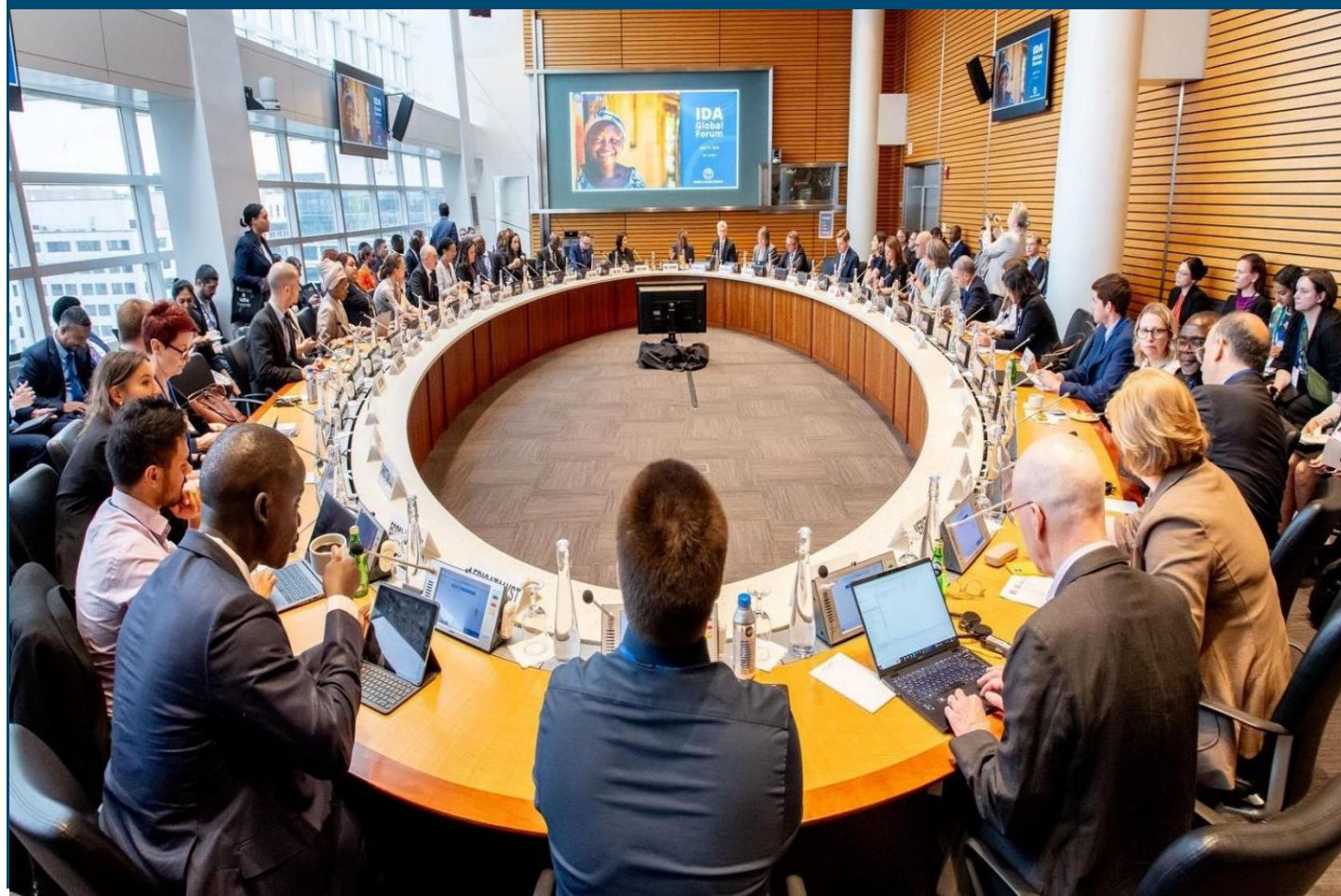
Photo: PROFOH delegates from Germany, Ghana, Nigeria, UK & USA at the IMF/World Bank Spring and Annual Meetings