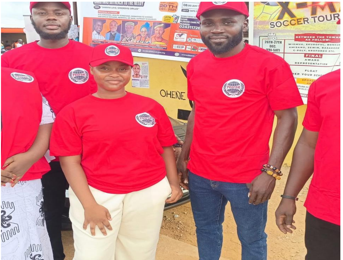
Photo: PROFOH Ghana team at the medical mission in Cape Coast

Elisand Care Foundation and PROFOH conducted a highly successful medical mission, tagged SMILE 2025, held in Cape Coast, Ghana. As always, the mission was designed to benefit underprivileged and vulnerable Ghanaians burdened by general medical conditions but unable to afford the high cost of quality healthcare. For decades, PROFOH has brought succour to thousands of Ghanaians through medical missions, manpower development, donations of medical equipment, education missions, and book donations. These efforts have ranged from Manna Mission Hospital in Teshie, Accra, to St. Moses Hospital in Poukasse, as well as donations of medical equipment and face masks to several public hospitals in Accra, including Ridge Hospital. Other medical missions have taken place in Ho in the Volta Region, Winneba Regional Hospital in the Central Region, and many other locations.