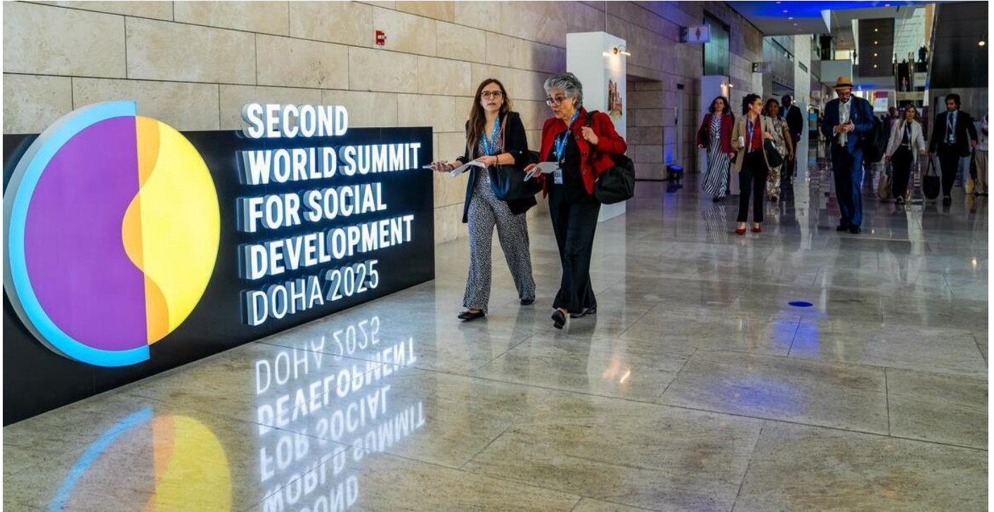
Photo: Arrival of our delegates at the second world Summit for social development.

ROFOH was specially invited to the Second World Summit for Social Development, where world leaders gathered in Doha, Qatar, thirty years after the landmark Copenhagen Summit. The World Social Summit advanced key commitments of the Pact for the Future, ranging from scaling up investments in youth and strengthening financing for development to redefining progress through the Beyond GDP agenda and deepening engagement with local and regional governments.