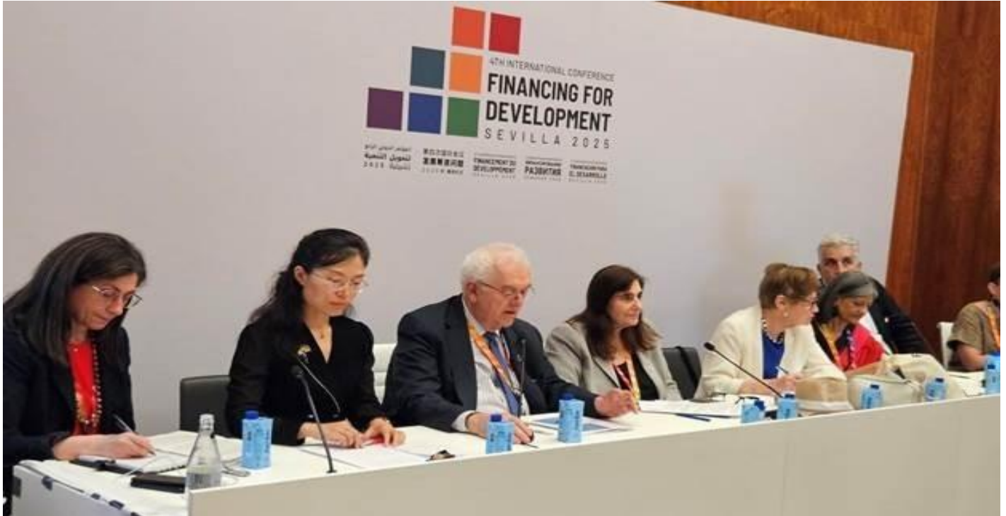
Photo: PROFOH delegates at a crucial session in Sevilla Spain during the conference

PROFOH actively participated in the Fourth International Conference on Financing for Development (FfD4) in Sevilla, Spain. PROFOH is also a member of the NGO Global Committee on Financing for Development (FfD4). Our participation sent a strong message of hope in support of humanity's global goals to end poverty.